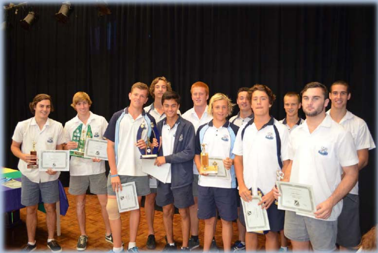
Our Perpetual Trophy Winners- Congratulations to these students on their exceptional efforts throughout this year in their particular sports.