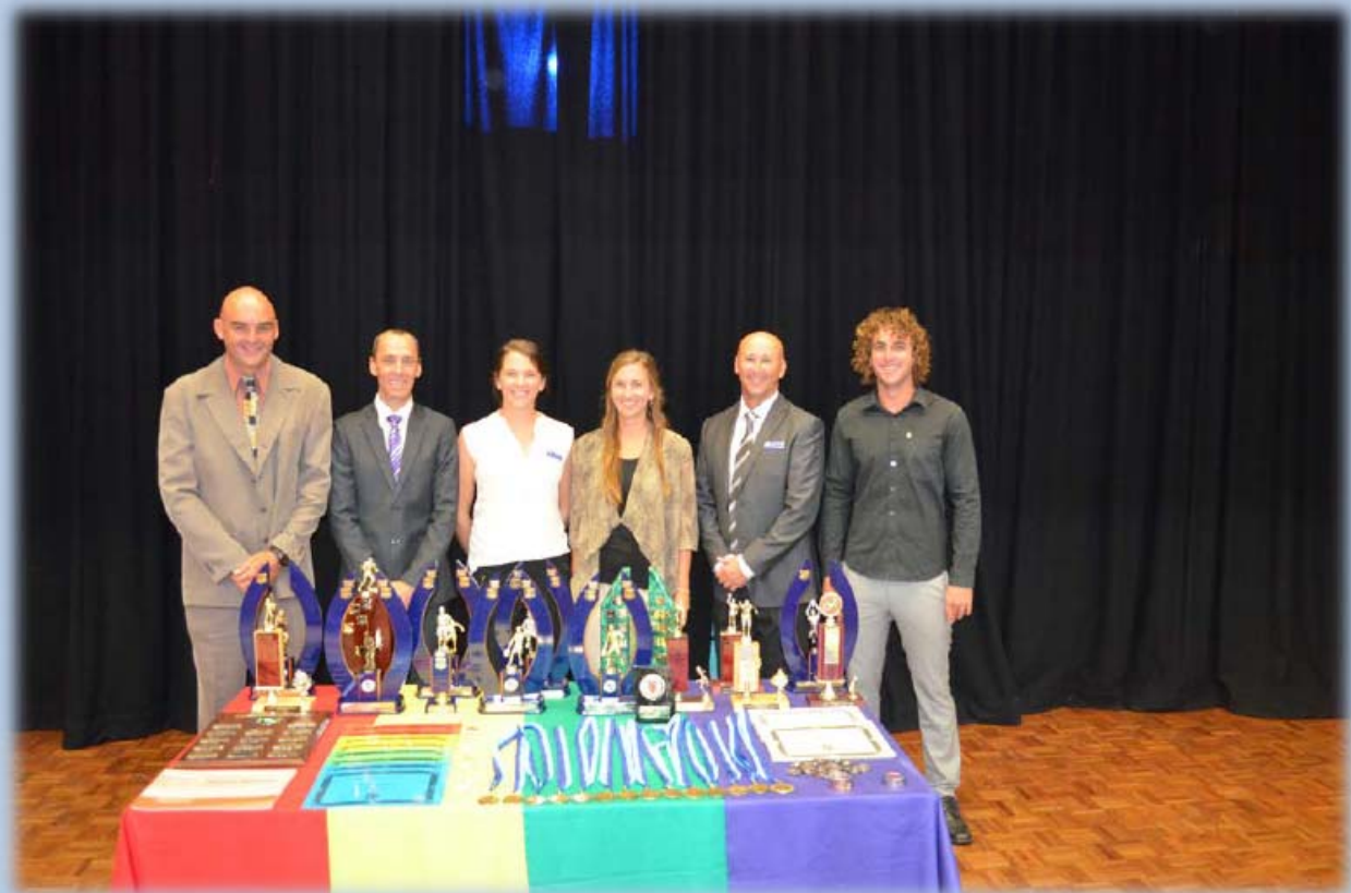
Thank you to our students for their cooperation at our annual Sports Assembly.