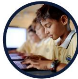
Develop life skills